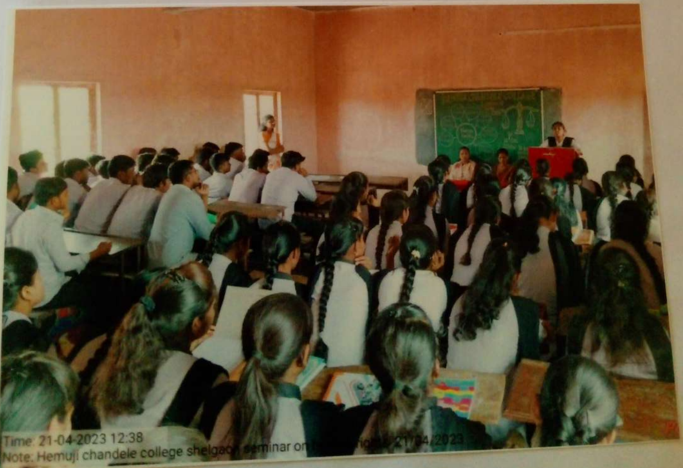
Time: 21-04-2023 12:38 Note: Hemuji chandele college shelgaon seminar on human rights 21/04/2023