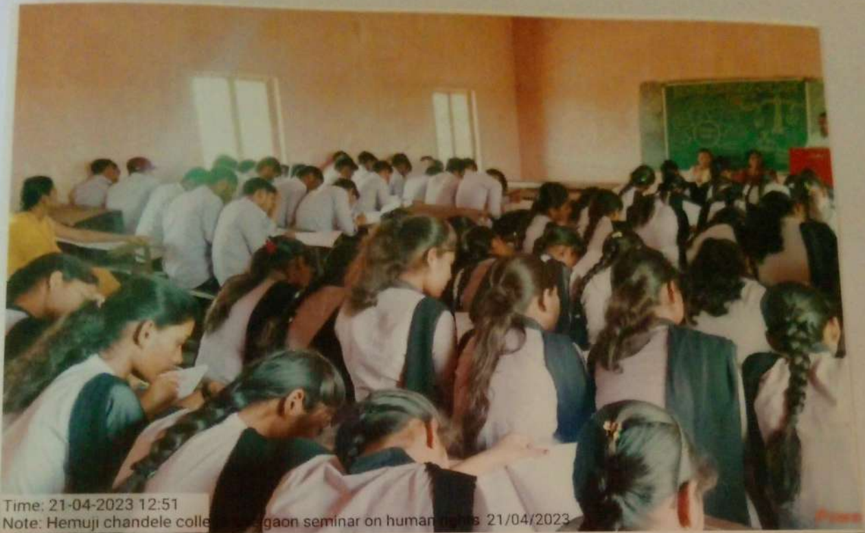
Time: 21-04-2023 12:51 Note: Hemuji chandele college shelgaon seminar on human rights 21/04/2023